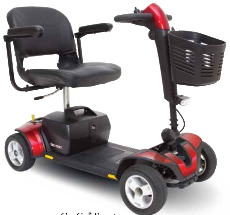
Go-Go® Sport, 4-Wheel