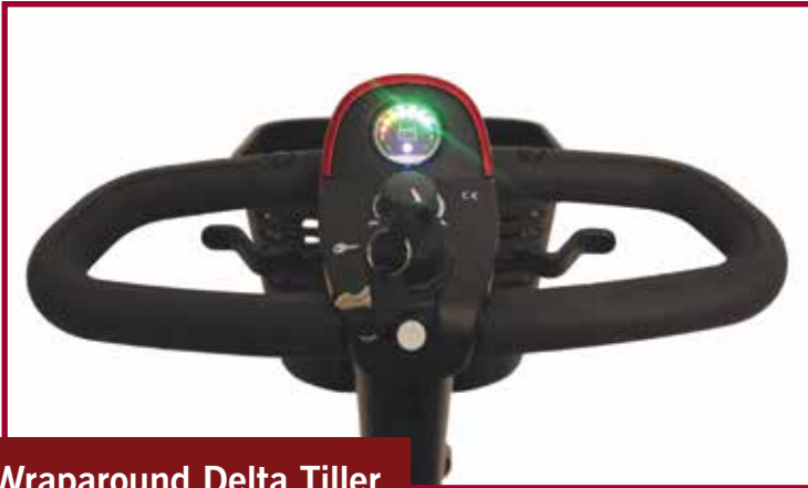
Wraparound Delta Tiller