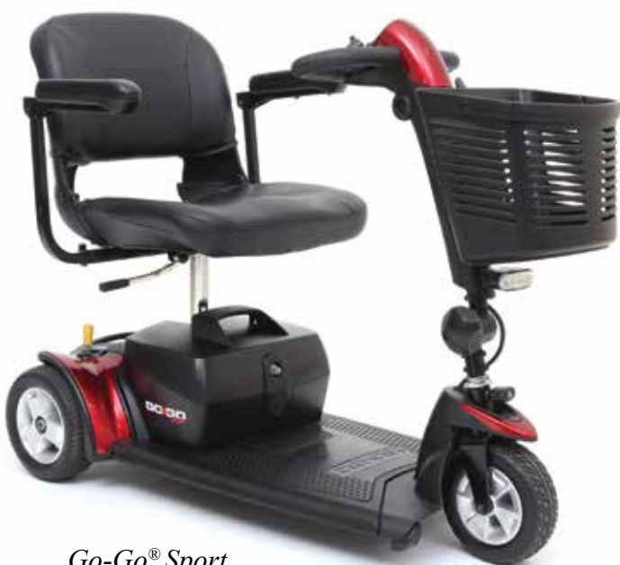
Go-Go® Sport, 3-Wheel

The Go-Go® Sport delivers high-performance operation and easy disassembly for convenience on-the-go. With a 325 lbs. weight capacity, charger port in tiller, and standard front LED lighting, the Go-Go Sport is feature rich and travel ready.