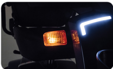
Front LED Lights and Indicators

The Pathrider® 10 Deluxe 2.0 Scooter delivers the same great performance you love, with new, contemporary features. Frosted headlights offer a touch of style while providing optimal illumination. An integrated USB charging port in the tiller allows you to power your smart device while on the go, and the convenient storage/cup holder in the tiller keeps your items close at hand. With Pride's signature feather-touch disassembly and front and rear suspension, the Pathrider® 10 Deluxe 2.0 is a new class of scooter.