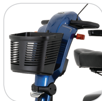
New Tiller Design