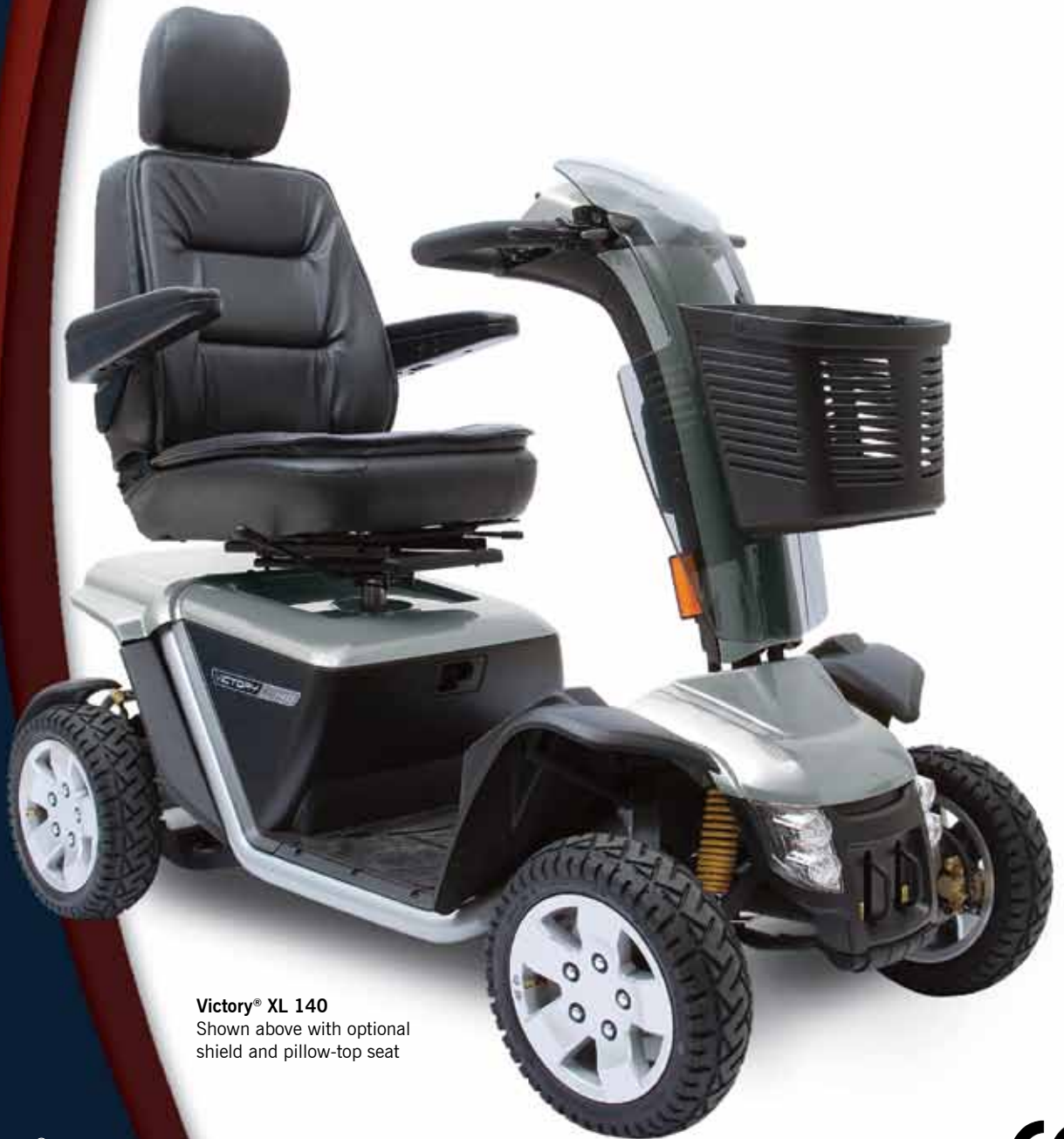
Victory® XL 140 Shown above with optional shield and pillow-top seat

Bristling with high-performance features like full suspension and a hydraulic sealed brake system, the Victory® XL 140 is a powerful blend of power and precision. The Victory XL 140 features sleek, aggressive style and a wealth of standard luxury touches like a wraparound delta tiller and LED lighting, making it the ultimate outdoor scooter.